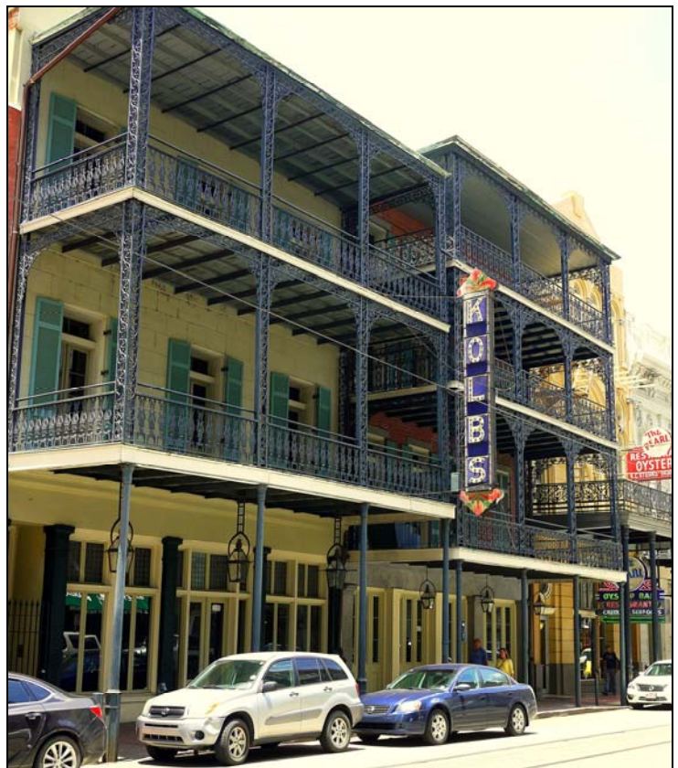
Kolb's Restaurant (2015). The façade is updated, but the inside is still gutted.

The homey Dutch Room featured captain's chairs and two gigantic fireplaces decorated with antique brass and copper cookware, along with large beams supported by ceramic Rubenzahl, the legendary German mountain spirits. The second floor was made up of several large private rooms paneled in red oak, and they opened onto wide, covered balconies.