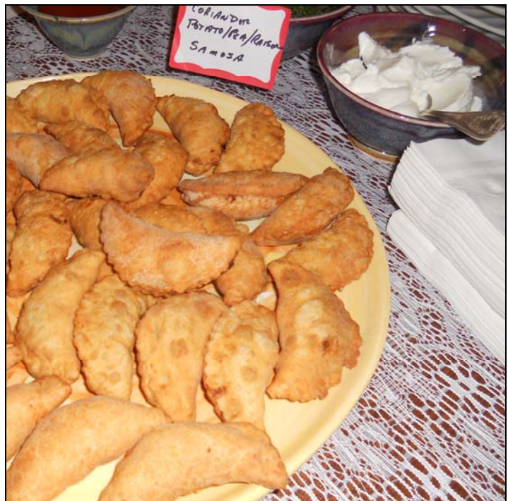
Bob Zorn’s mini-samosas.

Anglo-Indian merchants and later colonial settlers made such masalas a fixture of their often lavish meals. They even created their own somewhat corrupted, off-the-shelf versions, almost invariably containing the “big three”: dried ground cumin, turmeric, and coriander. They called this “curry powder”,