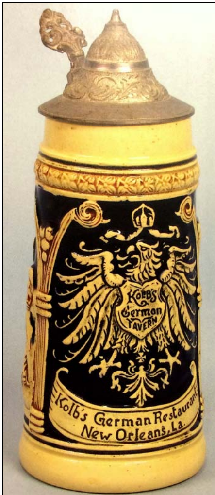
A Kolb's beer stein.

For many years, owners used this distinction almost to the point of gimmick, with an eye-popping number of German-titled dishes such as Huhn im Topf, mit Gemuese und Nudeln (chicken in broth with vegetables and noodles), and Gebratene Ente (roast duck with fruit dressing, red cabbage, and potatoes). At one point this German-heavy menu even prompted management to print a "Glossary of German Words" on the back of the menu. This focus on all things German apparently impressed the National Restaurant Association, which, in 1967, gave Kolb's first place in its Menu Idea Exchange Contest.