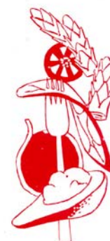
A 1977 German-Creole menu from Kolb's.