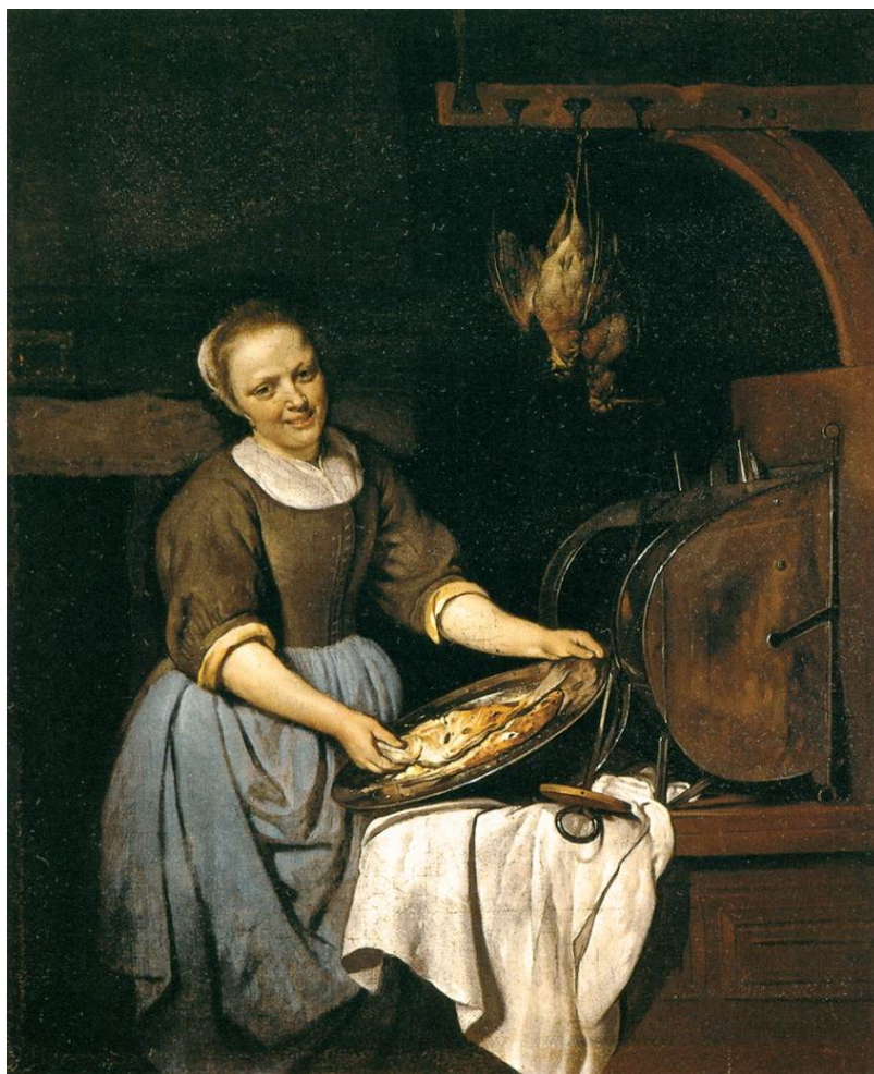
"The Cook", painted during 1657-67 by the Dutch artist Gabriël Metsu

A family that had a cow also needed a churn to turn cream into butter, and wooden firkins, tubs and ceramic pots to store the butter. Dutch residents produced fine butter. They carved wooden butter-bowls and paddles with which to press out the buttermilk, cleansing it to prevent rancidity. They also created carved wooden butter molds in fanciful designs. Sometimes butter was wrapped in a cloth and stored in a basket set in a cool cellar or a well. Buttermilk was (and still is) delicious when allowed to stand overnight and sour, and for this purpose jars, lidded tin containers, and stoneware or ceramic pitchers were used, often covered with a cloth to keep out flies. Leather and wood buckets were common among the less affluent. The Dutch also wove cheese baskets, used for draining cheeses-in-the-making, among them the famous Edam.