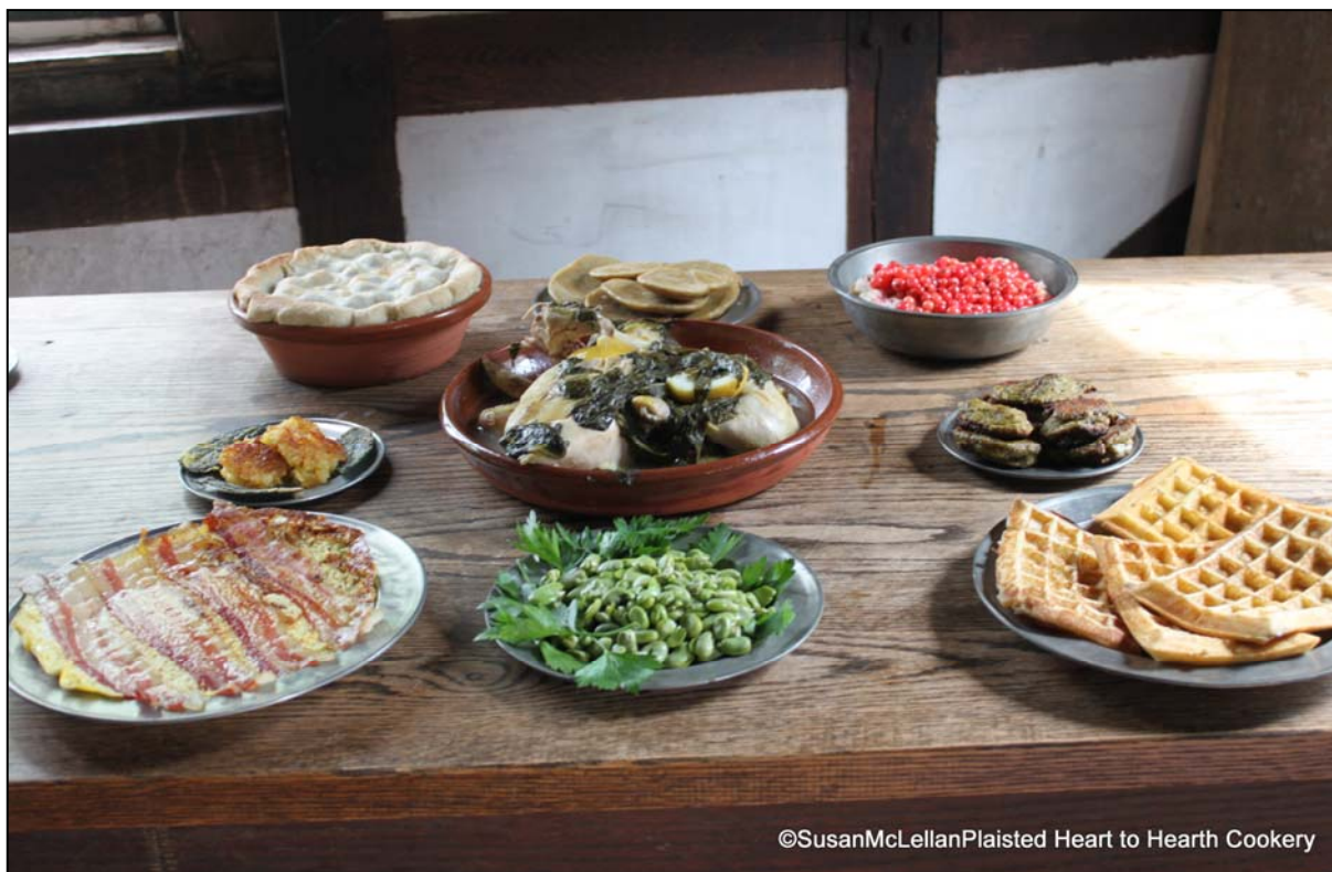
Heart to Hearth Cookery

Pennsbury Manor, the recreated 1680s home of William Penn, where she organizes demonstrations on the third Sunday of every month. She is a founding member, Past President, and past newsletter editor of the Historic Foodways Society of the Delaware Valley, a member of Culinary Historians of New York, Culinary Historians of Washington DC, and Past Masters in Early American Domestic Arts. In addition, she is a member of the Food History Committee of both the Association of Living History Farms and Museums (ALHFAM) and the International Association of Culinary Professionals (IACP).