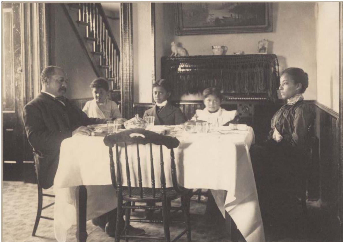
The dining table of a graduate of the Hampton Normal and Agricultural Institute, Virginia.

Photo: Frances Benjamin Johnston, c. 1900.