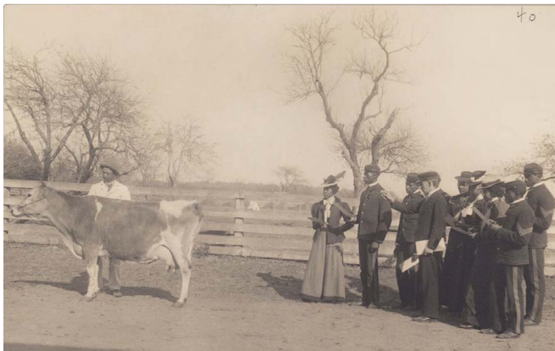
A study of the cow by a class at the Hampton Normal and Agricultural Institute, Virginia.