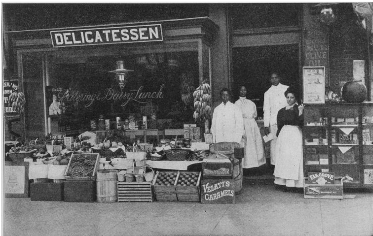
A successful Black-owned food store in Washington, DC.

Photo: Kelly Miller and Joseph R. Gay, Progress and Achievements of the Colored People (Washington, DC: Austin Jenkins, 1917)