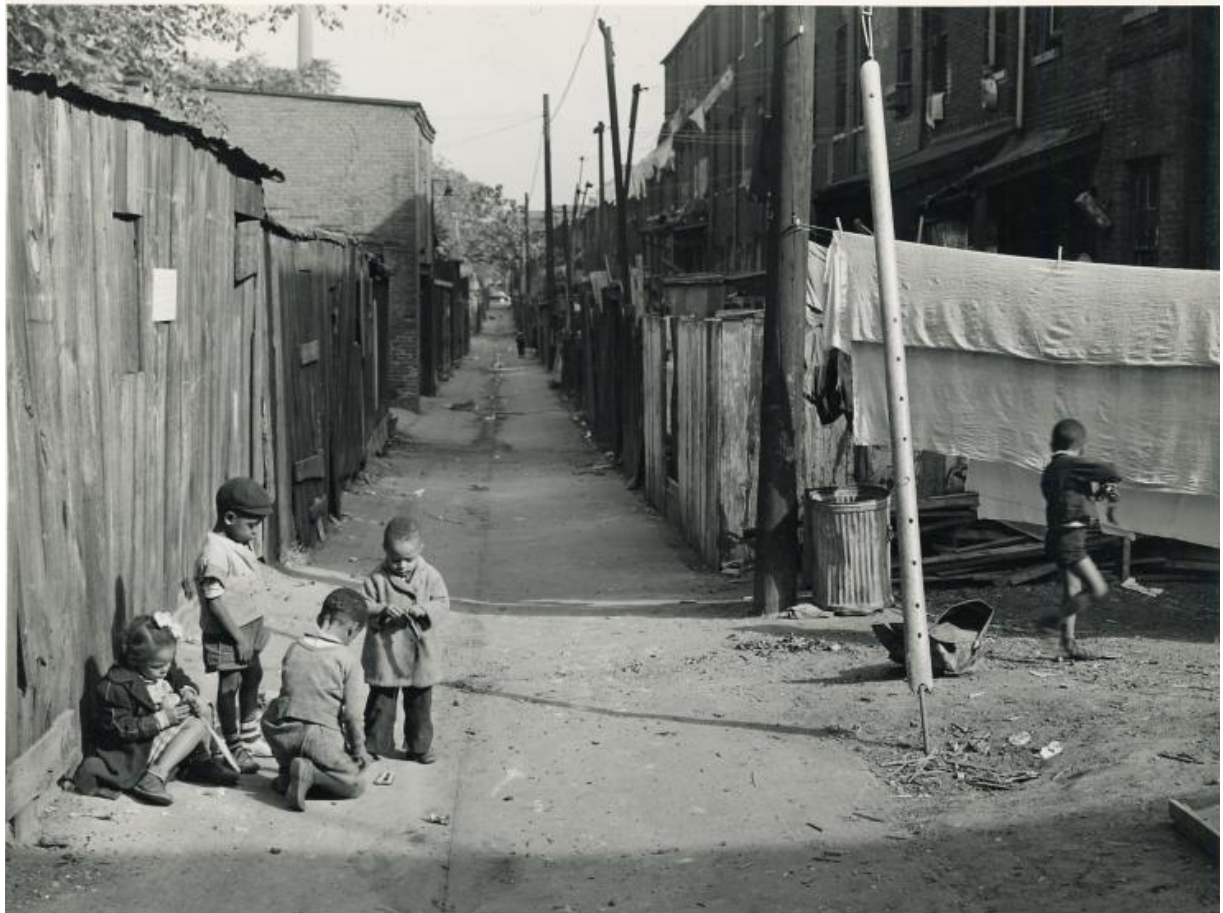
Photo: Marion Post Wolcott, c. 1940, U.S. Farm Security Administration Collection.

the African American diet in Philadelphia and Washington and were used even less often, if at all, in white households.