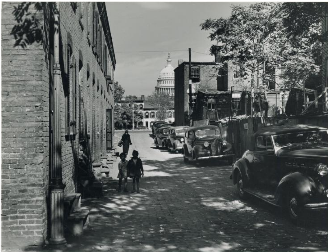
African American tenements in the shadow of the Capitol building (Temple Court off D Street and Delaware Avenue SW), Washington, DC.

Photo: Marion Post Wolcott, c. 1940, U.S. Farm Security Administration Collection.