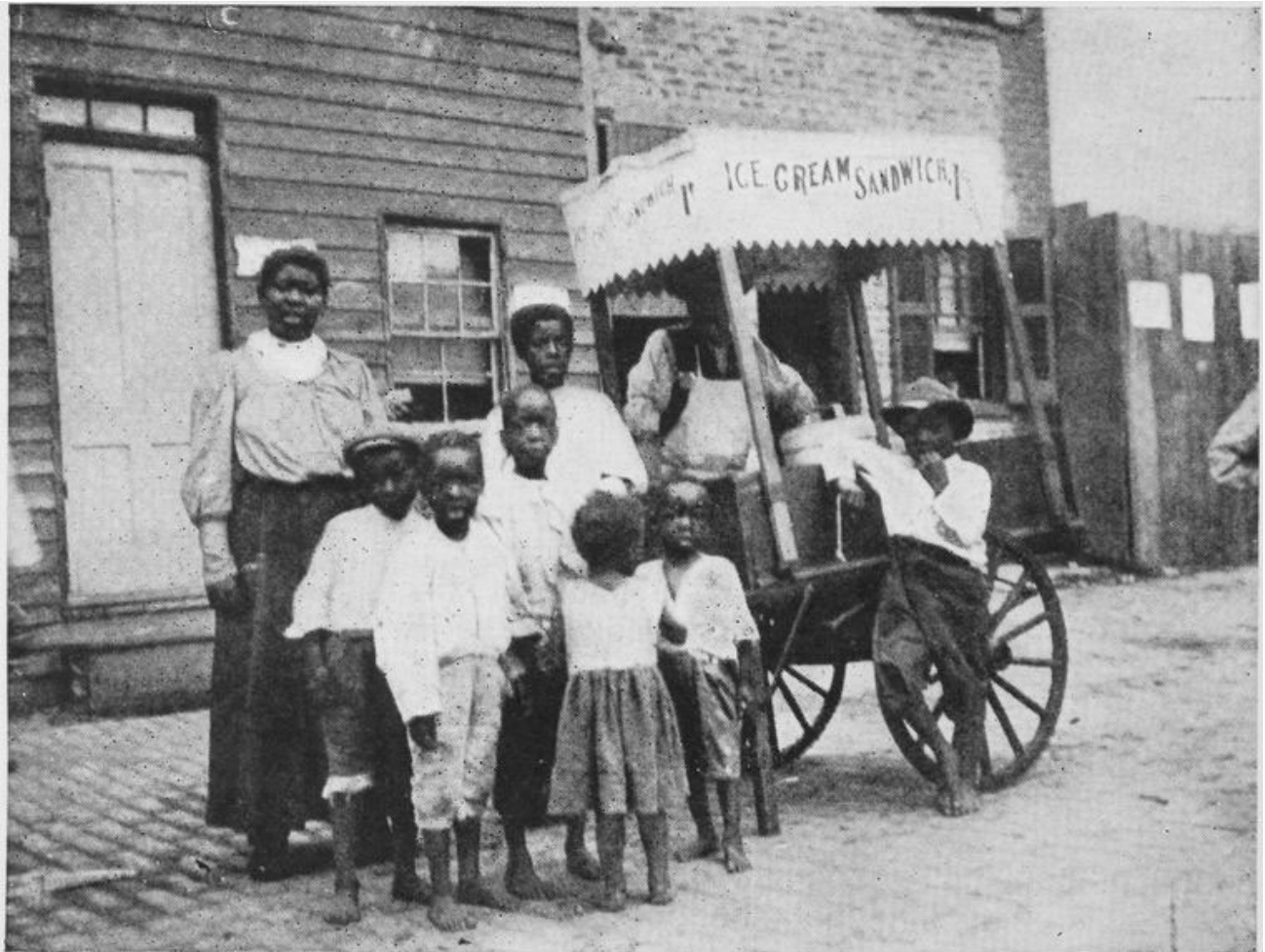
An ice cream sandwich vendor in an alley in Washington, DC, one century ago.

Photo: Charles Frederick Weller, Neglected Neighbors: Stories of Life in the Alleys, Tenements and Shanties of the National Capital (1909)