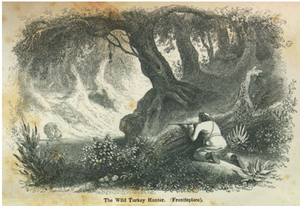
"The Wild Turkey Hunter", frontispiece from a book by Louisiana writer Thomas Bangs Thorpe, The Hive of "The Bee-Hunter," A Repository of Sketches, Including Peculiar American Character, Scenery, and Rural Sports (New York: D. Appleton and Company, 1854).